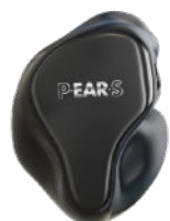
SH-2 CUSTOM MADE