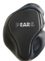
SH-3 CUSTOM MADE