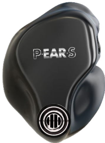
AT-2 CUSTOM MADE